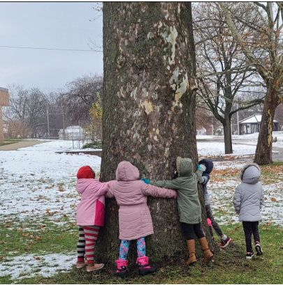
Measuring 5-7 friends in circumference (or 13 feet and nearly 4 feet in diameter) this neighborhood elder enjoys hugs and love from little ones daily!

Today, its 72' canopy provides shade uniting both sides of what was once a neighborhood street. Like the Riddle family themselves, its strong roots in the Westside neighborhood provide strength and service to the community. Based on its size this sycamore likely was one of the first members of our neighborhood as it is at least 120 years old and could be as much as 150 to 200 years old.