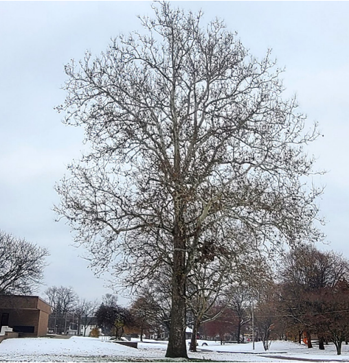
A home once stood between the sycamore and present south entrance of Riddle Elementary.