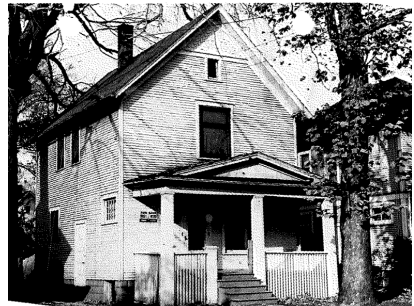
1314 W. Washtenaw St. home & sycamore companion pictured in the 1960s.