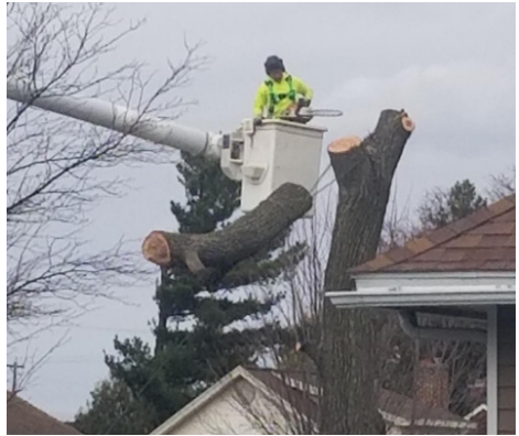
City of Lansing Forestry staff safely remove an aging Norway maple from Westmoreland in November 2022.

Though Norway maples can live up to 200 years in native conditions, spending 90-100 years in the Westside Neighborhood sounds alright to me. One at a time, trees composing the symmetry and simplicity that was once favored have left; their absence now providing an opportunity to grow the diversity that makes my street, our neighborhood and our community a better place.