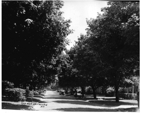
A view of the 600 block of Westmoreland Ave. (1947), looking south from the intersection of Dinsmore and Westmoreland, makes a strong case for street trees in the Westmoreland Subdivision.

What seemed like a really good idea at the time has underscored the benefits of diversity. The ease of installation and planning