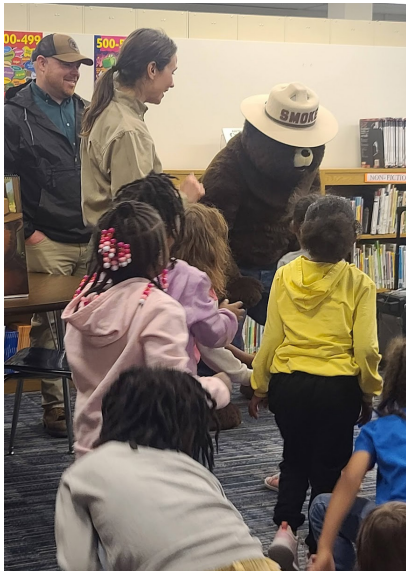
Smokey Bear makes friends with Riddle Elementary students.